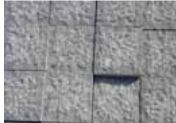
Fleuri Cut / Sawn Cut